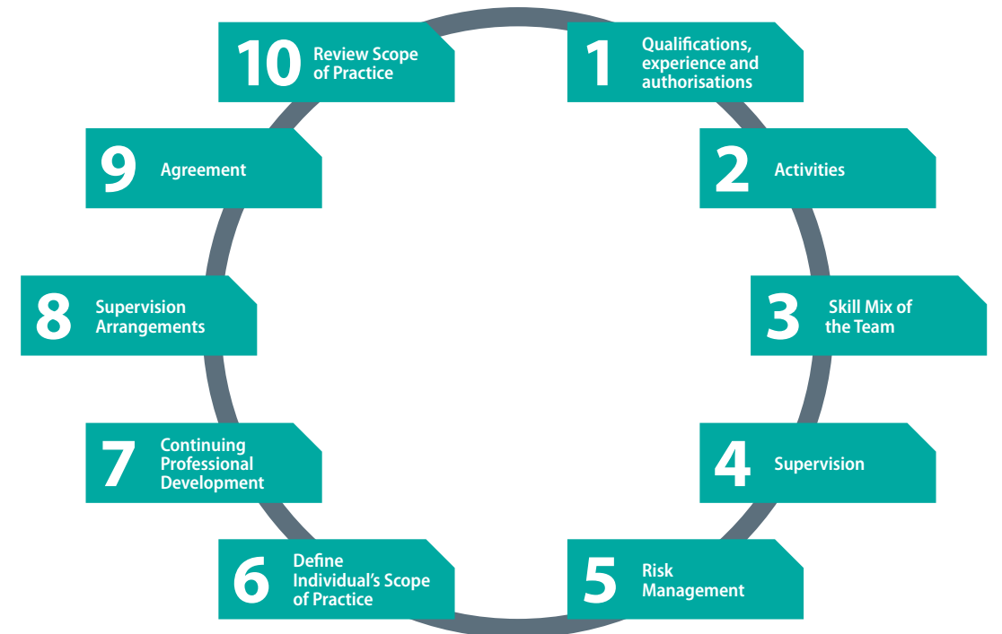
Figure 2. Process for Determining Individual Scope of Practice

The following section describes a step-by-step guide for determining an individual Health Worker's/Health Practitioner's scope of practice.<sup>7</sup> Figure 2 provides a summary of this process. A template titled " Tool for Determining Scope of Practice for an Aboriginal and/or Torres Strait Islander Health Worker /Health Practitioner " has also been provided in Appendix 1 to assist in working through this process.<sup>d</sup>