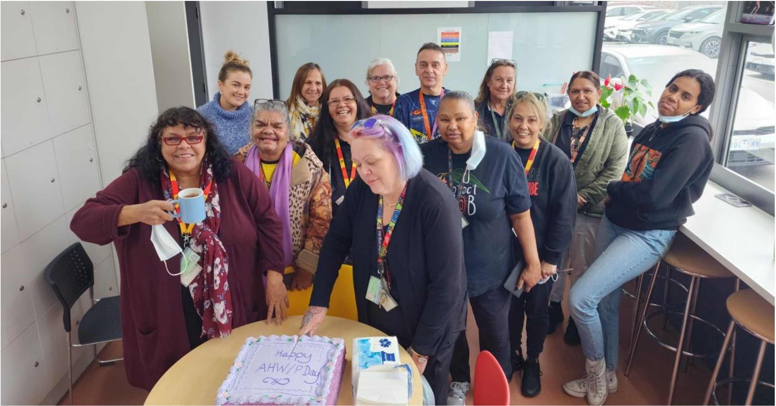
Victorian Aboriginal Health Service Staff celebrates the National Day