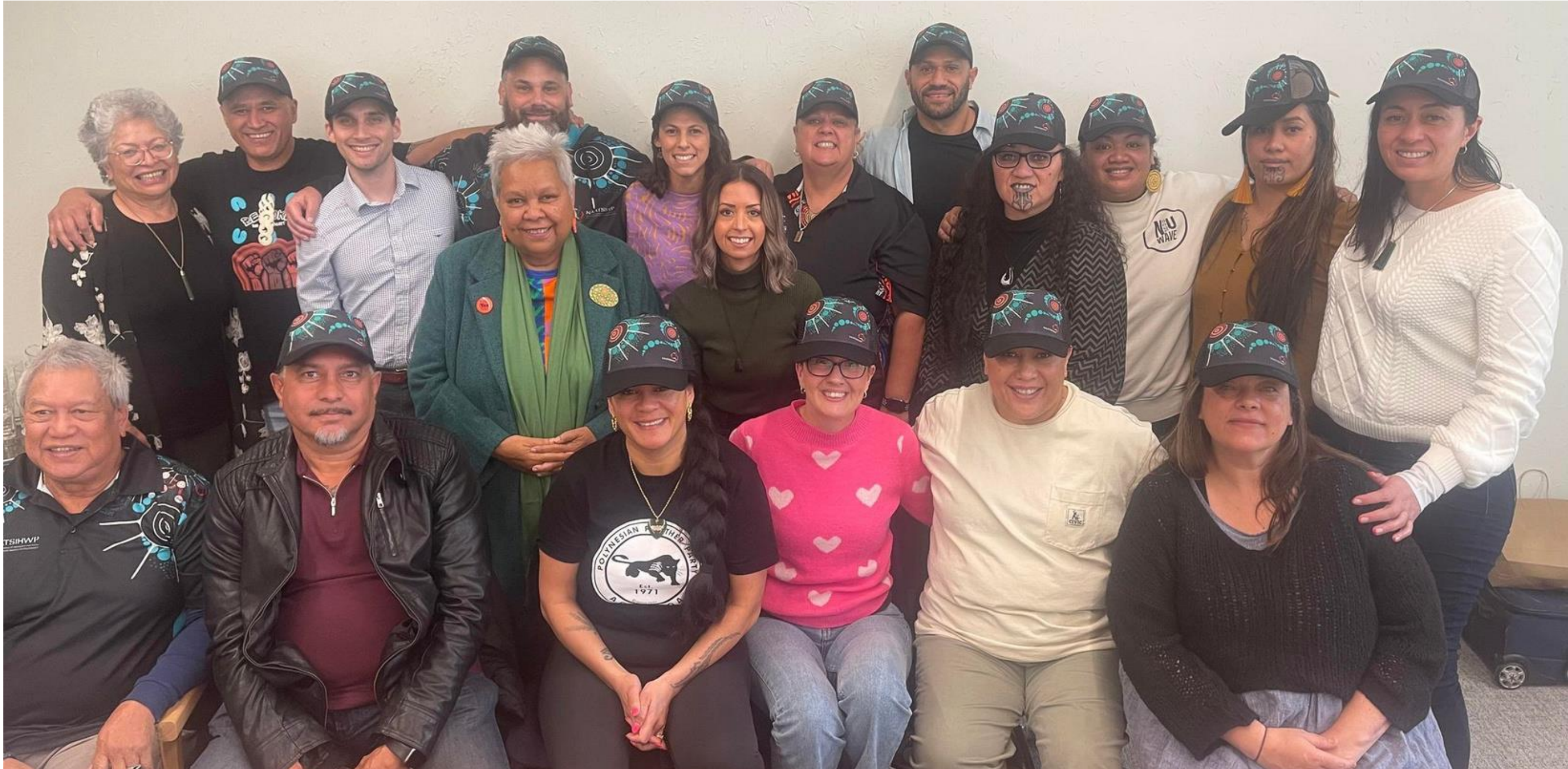
Atlantic Fellowship for Social Change leaders celebrates the National Day